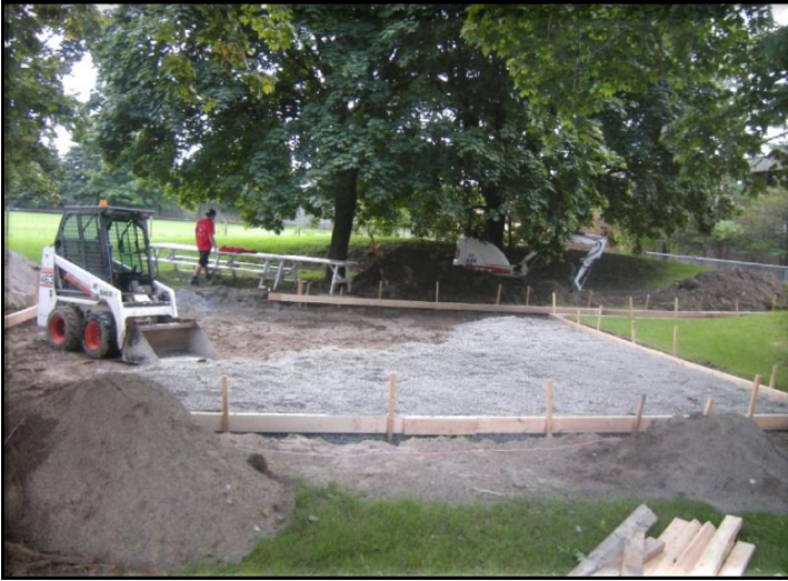
The basketball pad in preparation for the concrete pouring.

Lawson Residence is a site blessed with space, both inside and out. The indoor gym has always seen lots of use but many people expressed an interest in taking those gym activities outside. While there is plenty of grass, there is little space for activities requiring a hard surface.