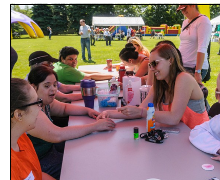
Picnic goers getting their nails done at our “fancy” nail salon.

Thank you so much to all our donors and supporters. Your contributions were vital to making the day enjoyable for everyone. See you next year!