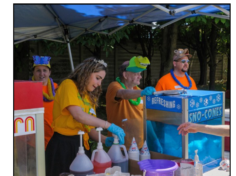
The Sno-Cone station open for business!