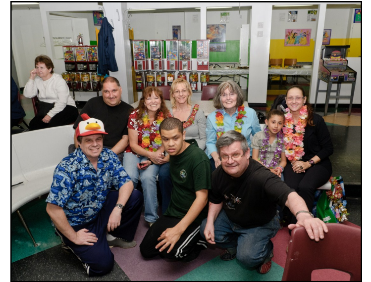
Having a blast at Scarborough Region's Bingo Bowling Extravaganza.