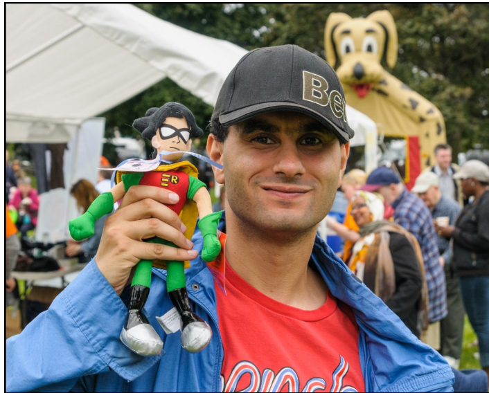
Prizes galore at a fun-filled Annual Picnic.