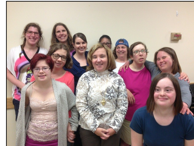
Individual participants from the most recent STEPS workshop take time out of their busy schedule to say "cheese".

Our innovative housing project LIGHTS continues to help individuals with an intellectual disability achieve independence by providing them with an opportunity to live in their own home with the support of their families, friends and caregivers.