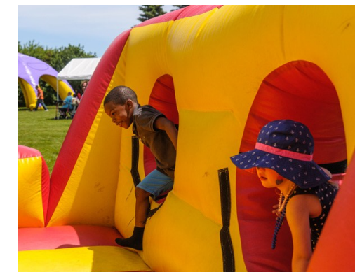
Kids braving the “Eliminator”.