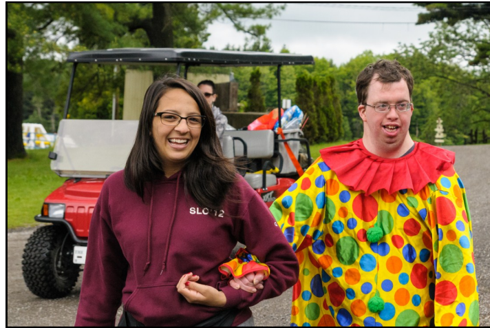
Lots of laughs at Shadow Lake Centre.

We can't say it often enough—thank you! We are very grateful for your generosity.