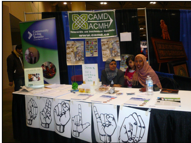
Project partners from the Canadian Association of Muslims with Disabilities at the Reviving the Islamic Spirit Conference.

Thanks to a new $115,100 grant from the Ontario Trillium Foundation (OTF), Community Living Toronto has partnered with Developmental Services Toronto (DSTO) on an exciting two-year project that will help improve access to services for ethno-culturally diverse families.