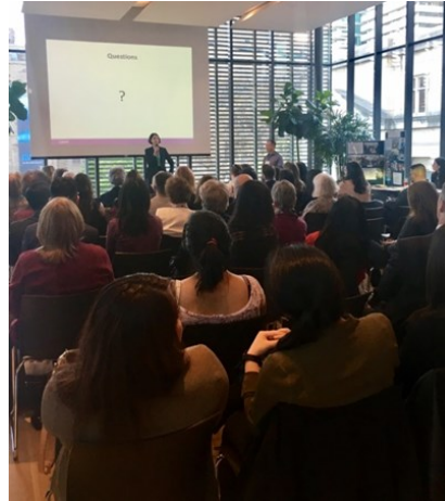
Alumni gather to hear about volunteering!

Earlier in May, Community Living Toronto was invited as one of 12 organizations to showcase our wonderful volunteer opportunities to a crowd of 100+ University of Toronto Alumni, who are looking to make a positive impact in their communities. The event was hosted by the University of Toronto's Alumni Association, and provided us with the opportunity to meet up and coming professionals who are interested in contributing their expertise to help organizations thrive.