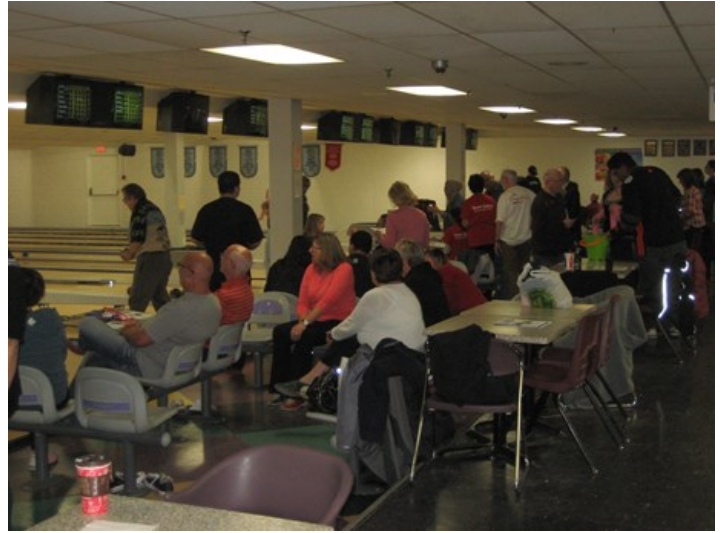
A great turnout at the Bingo Bowling Extravaganza!

The event had many wonderful donors of gifts and gift cards that were used as prizes for bowling and the raffle. We are very grateful to these donors including the family of Debby White, who offered the sweets table.