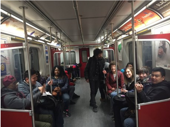
Riding the Rocket on Field Instruction Day!