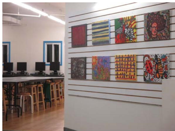
Original paintings on display at Visual Arts Brampton created by CVS artists

For more information about Creative Village Studio, contact Harold Tomlinson at 647-351-4362 or visit http://cltoronto.ca/hubs/creative-village-studio/