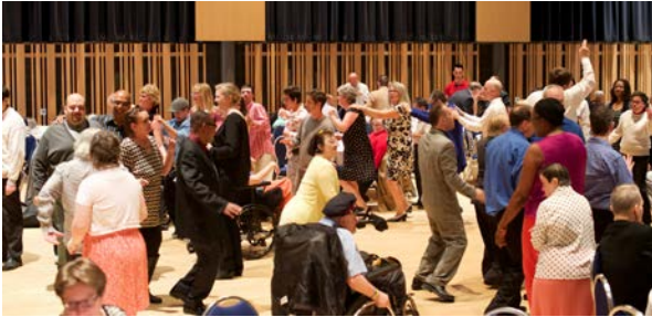
Dancing up a storm at last year's Spring Fling Dinner & Dance!

Spring has officially sprung and the glimpses of sunshine bring the promise of brighter days. With this welcome seasonal change comes our annual Spring Fling!