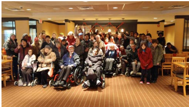
One big happy group at Betty's Restaurant