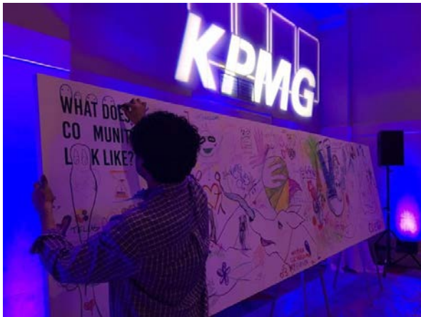
An activity at the United Way Toronto and York regions "Rouge 2017" Fundraiser.