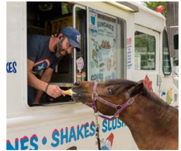
The Pony and Ice Cream Truck making friends.