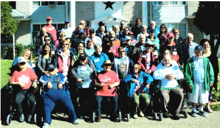
Annual Group Picture at Colonial Resort and Spa —Most people who have attended this trip have collected these group photos since 2006!