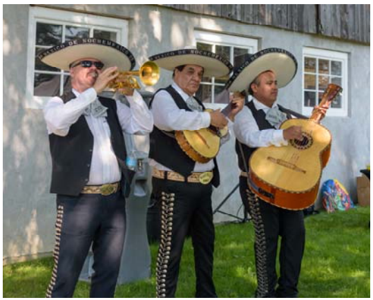
The Mariachi Band!