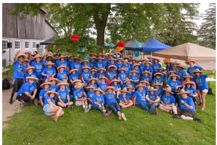
A group photo of everyone that came to Duncan's Farm Day!