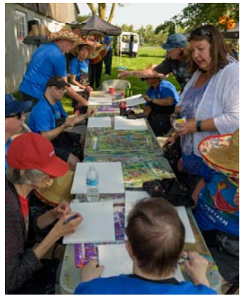
Creative Village Studio's table!