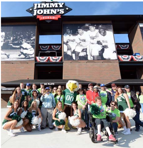
Sporting Custom T-Shirts at Jimmy John's Field in Utica